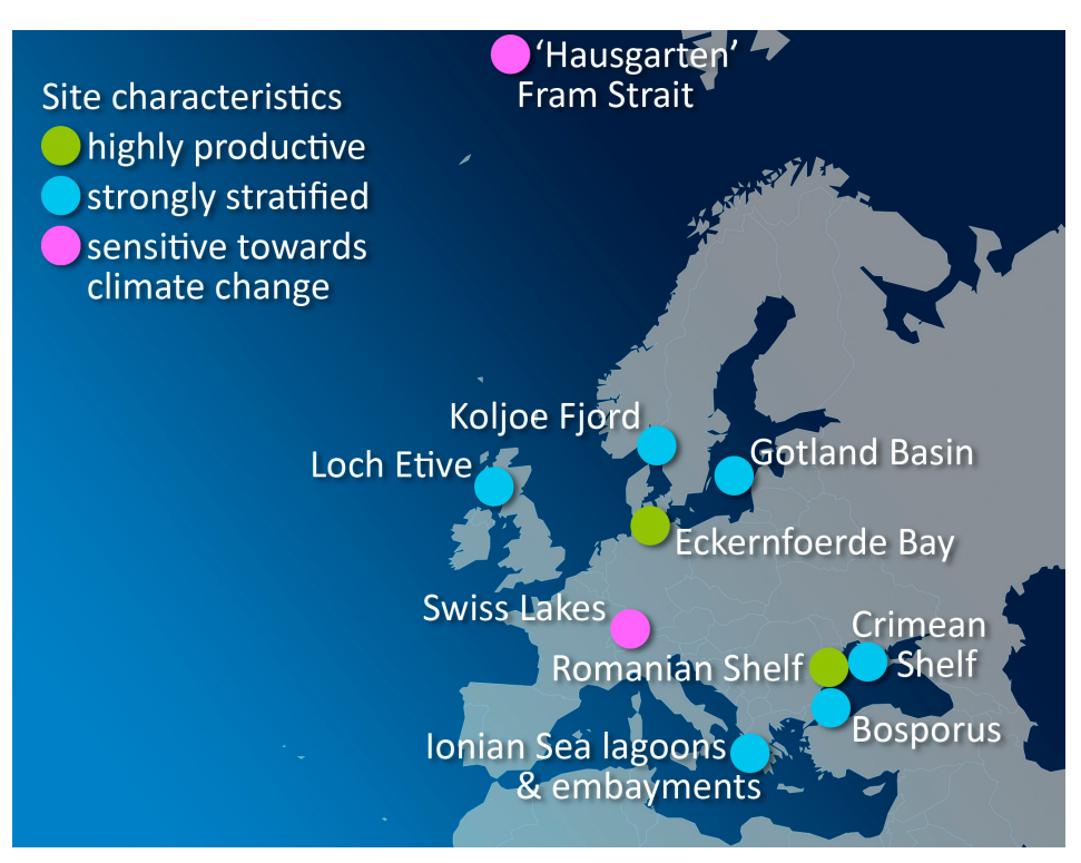
Overview of the HYPOX target sites categorized according to main oxygen depletion characteristics. 'Sensitive towards climate change' signifies sites where oxygen availability at depth may reduce due to climate change impacts on deep circulation. (Figure: Sabine Luedeling, www.medieningenieure.de)

The project HYPOX focused on coastal systems and lakes where hypoxia is particularly common. Here, nutrient input from land can support high growth rates of microalgae. If this matter sinks to the seafloor a high oxygen demand is created. Bottom water hypoxia often occurs in summer, when high water temperatures and weak winds decrease oxygen solubility